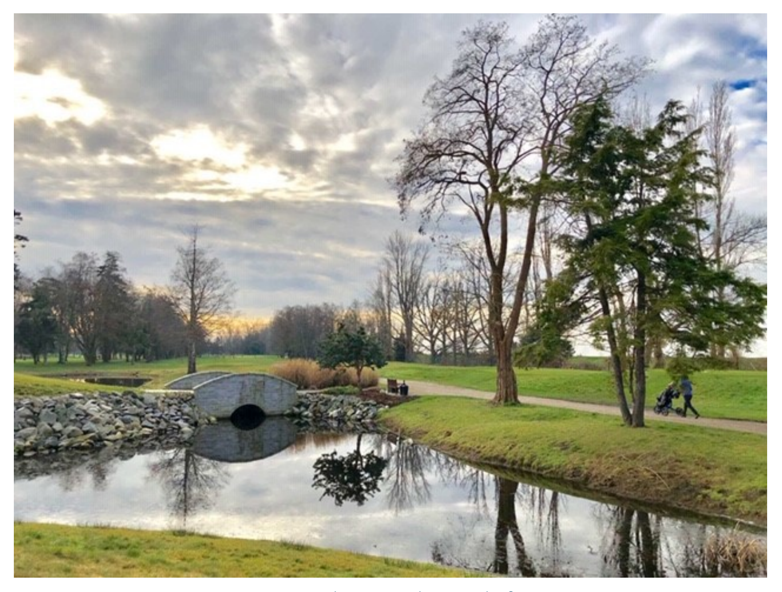
Honouring the past, embracing the future

The local First Nations peoples called the low lying land "Quilchena" meaning running water, sweet water, or many waters. On August 4, 1925, the evocative word was chosen as the name for a fledgling golf club.